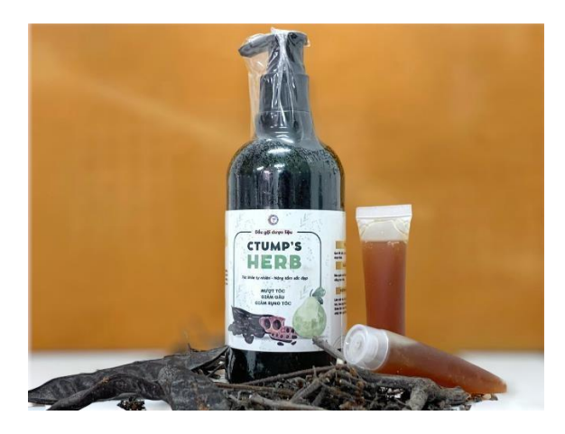
Figure 1: CTUMP's Herb shampoo

The data were expressed as the mean \pm standard deviation (mean \pm SD). The results were processed in Microsoft Excel and analyzed for statistical significance using SPSS 26 (SPSS, Inc., Chicago, IL, USA) through One-Way ANOVA and Student's T-test, with differences considered significant at P < 0.05.