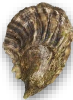
Figure 2: Crassostrea gasar (mangrove oyster) X 90