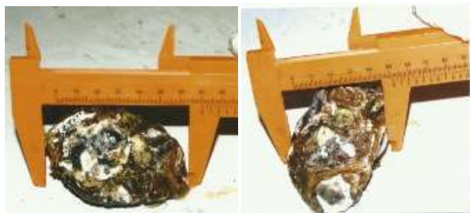
Figure 3: Crassostrea gasar with the Vernier caliper Mg X 8.0MP

After incubation, colonies on plates with bacterial and fungal growth were enumerated and the results expressed as CFU/g and/or CFU/mL for the Total Heterotrophic Bacterial Counts (THBC), Total Coliform Counts (TCC), Faecal Coliform Counts (FCC), and Total Fungal Counts (TFC), respectively. 6 Thereafter, colonies were sub-cultured onto NA and SDA plates, and incubated for 24 hours at 37°C (bacteria) and 28°C ± 2 for 72 hours (fungi). The pure cultures were streaked onto NA and SDA slants, incubated for 24 hours at 37°C and 28°C ± 2 for 72 hours, and thereafter deposited in the freezer at 4°C for morphology identification and characterization. The tests were repeated thrice and the results obtained were expressed as mean ± Standard Deviation (mean ± SD).