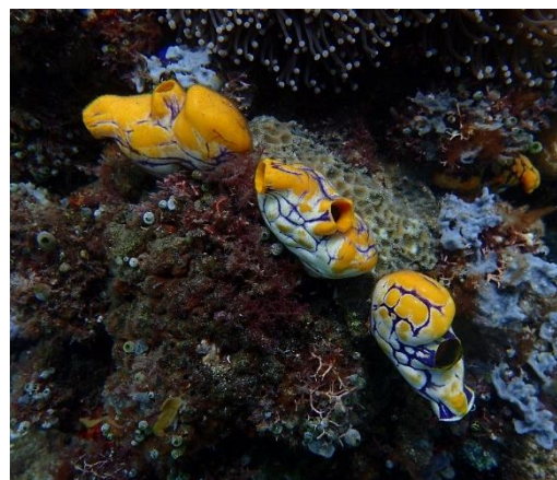
Figure 1: Indonesia marine ascidian Polycarpa sp.

In the present study, two known alkaloid compounds polycarpine (1) and polycarpaurine A (2) were isolated from Indonesia marine ascidian Polycarpa sp. Following a thorough investigation of the spectroscopic data, their structure was established. With inhibition zones of 12 and 10 mm, respectively, the isolated chemicals polycarpine (1) and polycarpaurine A (2) exhibited towards M. smegmatis at 50 µg/disc. The chemicals polycarpine (1) and polycarpaurine A (2) hold considerable promise for the development of anti-tuberculosis medications.