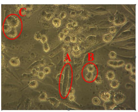
Figure 2: Morphology of MCF-7 cell after the application of leaves extract (25 \mu g/mL). (A) Normal MCF-7 Cell (B) Cell shrinkage (C) Membrane blebbing.

Elevated ROS levels play an essential role in carcinogenesis, tumor metastasis, and maintenance of the phenotypic characteristics of cancer cells. By increasing antioxidant intake, increasing cellular antioxidants, and targeting sources of ROS, oxidative stress can be eliminated, further causing growth inhibition and increased susceptibility to cell death in cancer cells. <sup>65</sup> Antioxidant compounds are able to attack and neutralize ROS and RNS. Antioxidants mainly act as chemical electron scavengers and stop or reduce free radical chain reactions. Antioxidant effectiveness is related to many factors, including activation energy, rate constant, oxidation-reduction potential, and solubility properties. Antioxidant efficiency increases with decreasing phenolic oxygenhydrogen bond strength. Therefore, modulation of intracellular ROS/RNS levels by antioxidants could be used to target oxidative stress-mediated cancer initiation, promotion, and progression. <sup>66</sup>