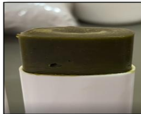
Figure 1: The Organoleptic appearance of the dosage form appears to be dark green and in the form of a solid stick

The highest SPF value, as shown in Table 4, was at a concentration of 5,000 ppm, which belongs to the ultra-protection category. Nevertheless, according to the sunscreen effectiveness based on the SPF value listed in Table 3, the SPF values of other concentrations also belong to the ultra-protection category. The average SPF value at each concentration was obtained based on the study's results. Namely, at a concentration of 2,500 ppm, an SPF value of 36.62 was obtained (ultra-protection category); for a concentration of 5,000 ppm, an SPF value of 38.66 (ultra-protection category) was obtained; for a concentration of 7,500 ppm an SPF value of 38.35 (ultra-protection category) was obtained; and for a concentration of 10,000 ppm, an SPF value of 38.33 (ultra-protection category) was obtained. The results shown indicated that the jackfruit sun stick protector has the potential to be a UV protector.