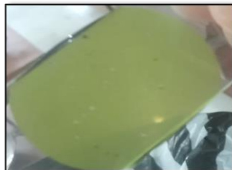
Figure 2: Homogeneity of the dosage form that appears homogeneous without coarse particles or lumps.