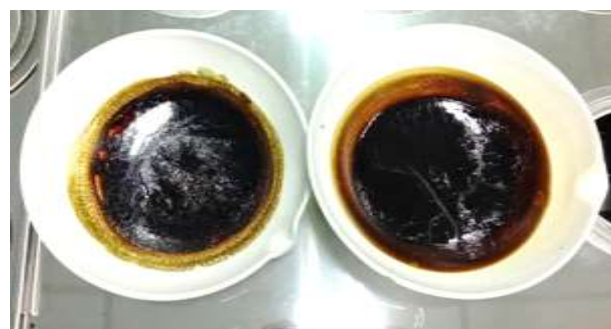
Figure 1: Bay leaf extract

From the curve, the linear regression equation is y = 0.0761x - 0.0166 , where y = absorbance, x = concentration and the value of the correlation coefficient (R 2 ) is 0.9998.