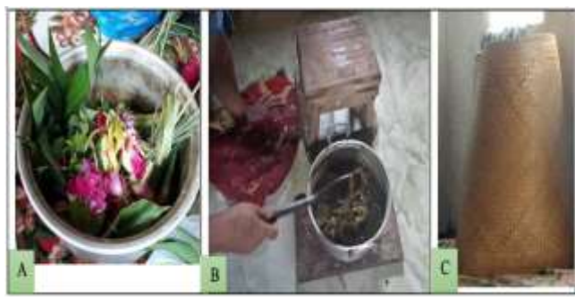
Figure 2: (A) Mix of plants in the tradition; (B) Wooden bench, pot, and wooden spoon; (C) Example of a mat used

It is concluded that using roses in aromatherapy can reduce stress and depression in humans. The use is not limited to just relaxation, and oils from ylang and lemon can also be useful in overcoming insomnia. 24